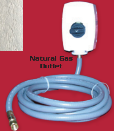
Natural Gas Outlet