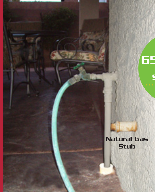
Natural Gas Stub